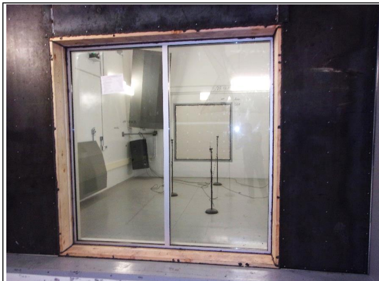
Receive Room View of Test Specimen