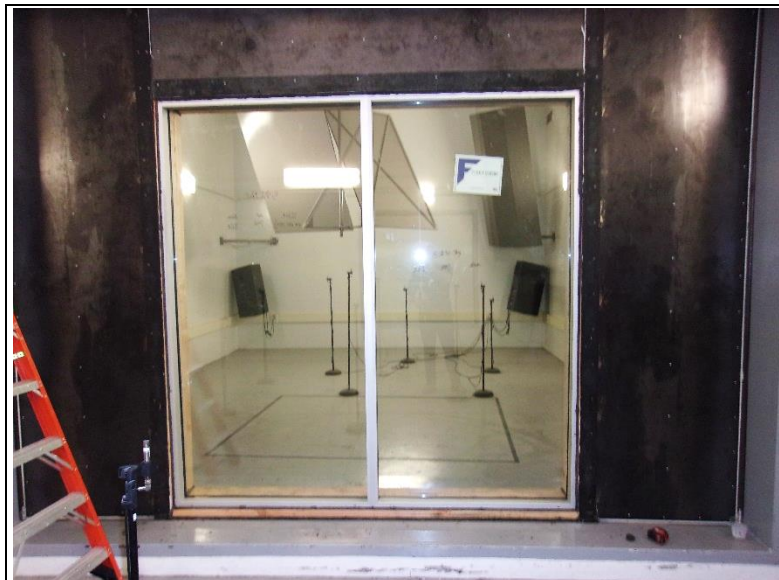
Source Room View of Test Specimen