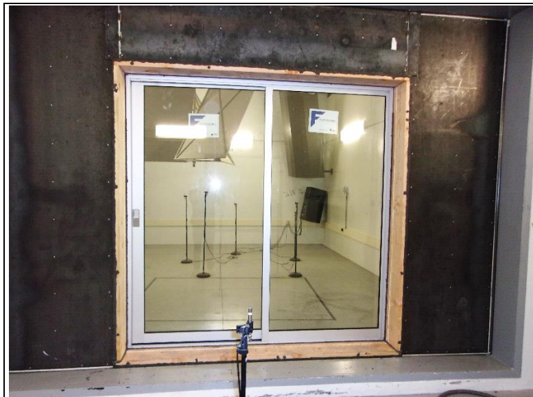
Source Room View of Test Specimen