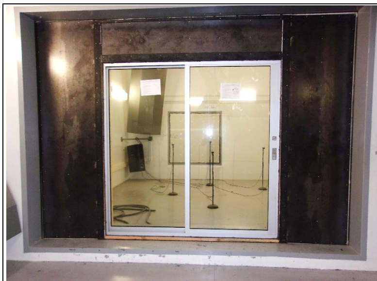
Receive Room View of Test Specime