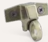
Spring Latch (4-Bar Hinges) (Series 450-T & 350-T)