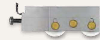
Roller - S.S. (Series 330-T)