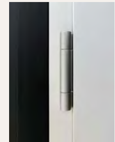
Butt Hinge - S.S. (Series 350-T)

Availability of hinges is based on operator type.