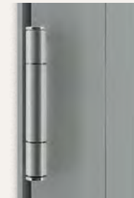
Butt Hinge - S.S. (Series 450-T)