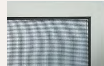
Flat & Sliding Window Screen (Series 450-T, 350-T, 330-T)