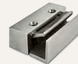
Strike & Latch - S.S. (Series 330-T)