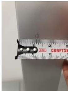
Archetype Narrow Lock Stile