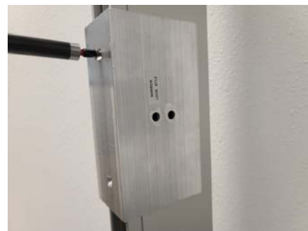
Archetype Narrow Lock Stile with Yoke