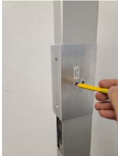
Archetype Narrow Lock Stile