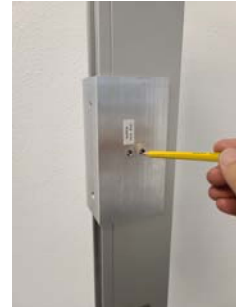
Archetype Narrow Lock Stile with Yoke