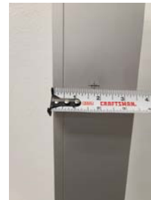
Archetype Narrow Lock Stile with Yoke