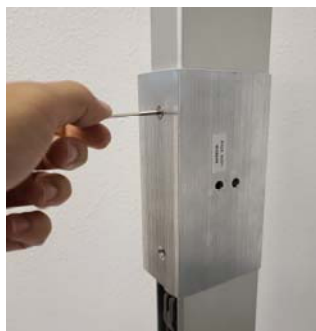
Archetype Narrow Lock Stile